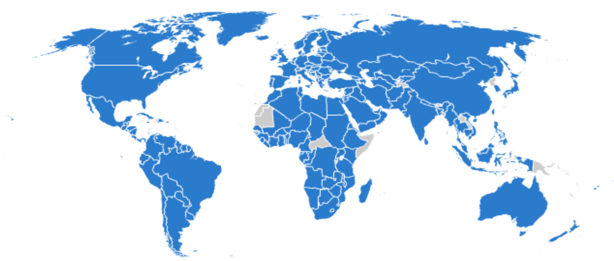
Figure 3. Nations Originating 5 or More SafetyLit Visitors per Month *

*Nations with fewer than 5 visitors per month are shown in gray.